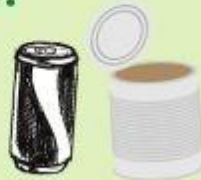
Cans and Tins