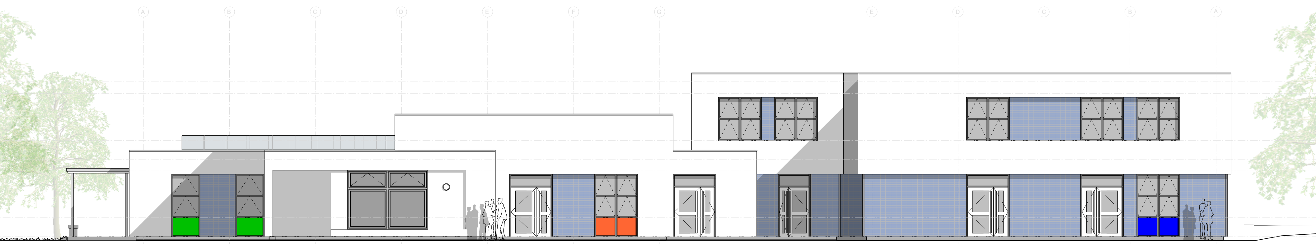
NORTH ELEVATION - PROPOSED 1:100