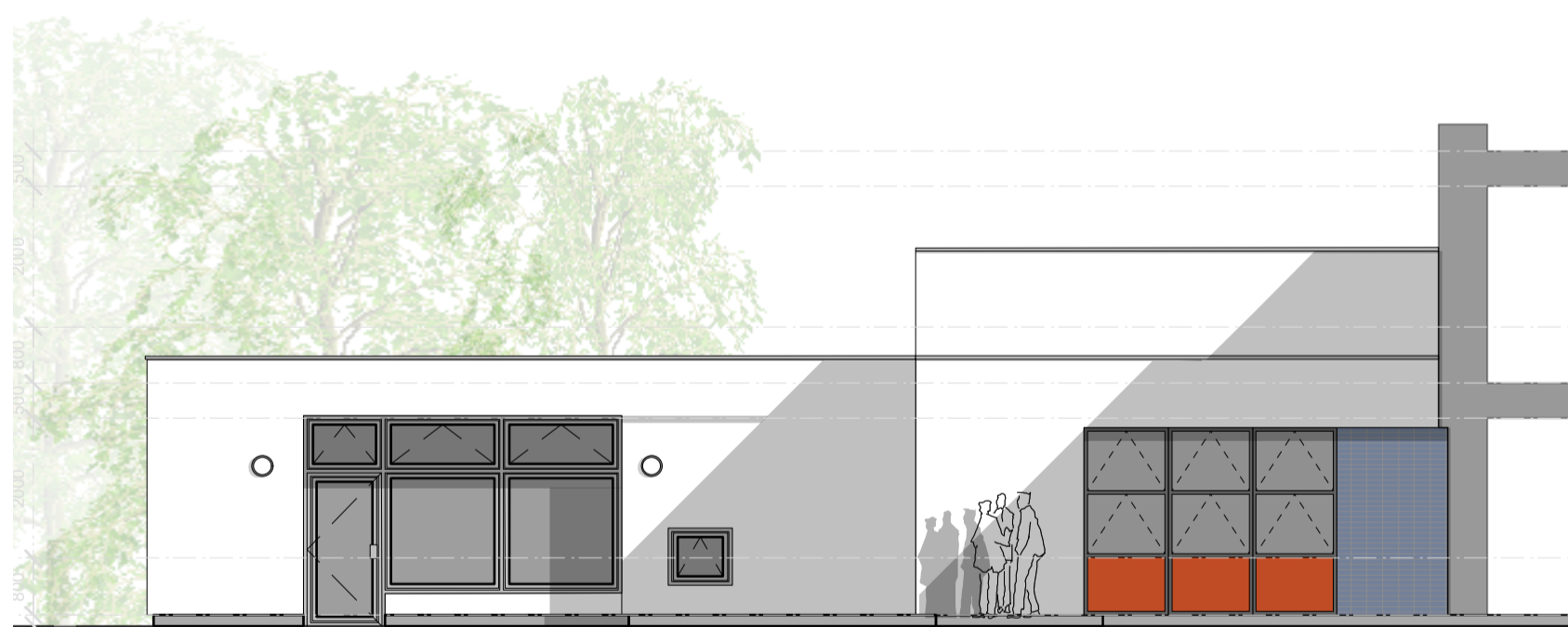
PART WEST ELEVATION - PROPOSED 1:100