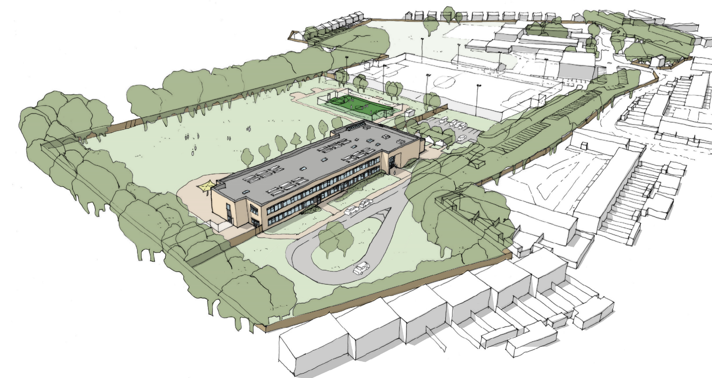
Proposed Site Massing