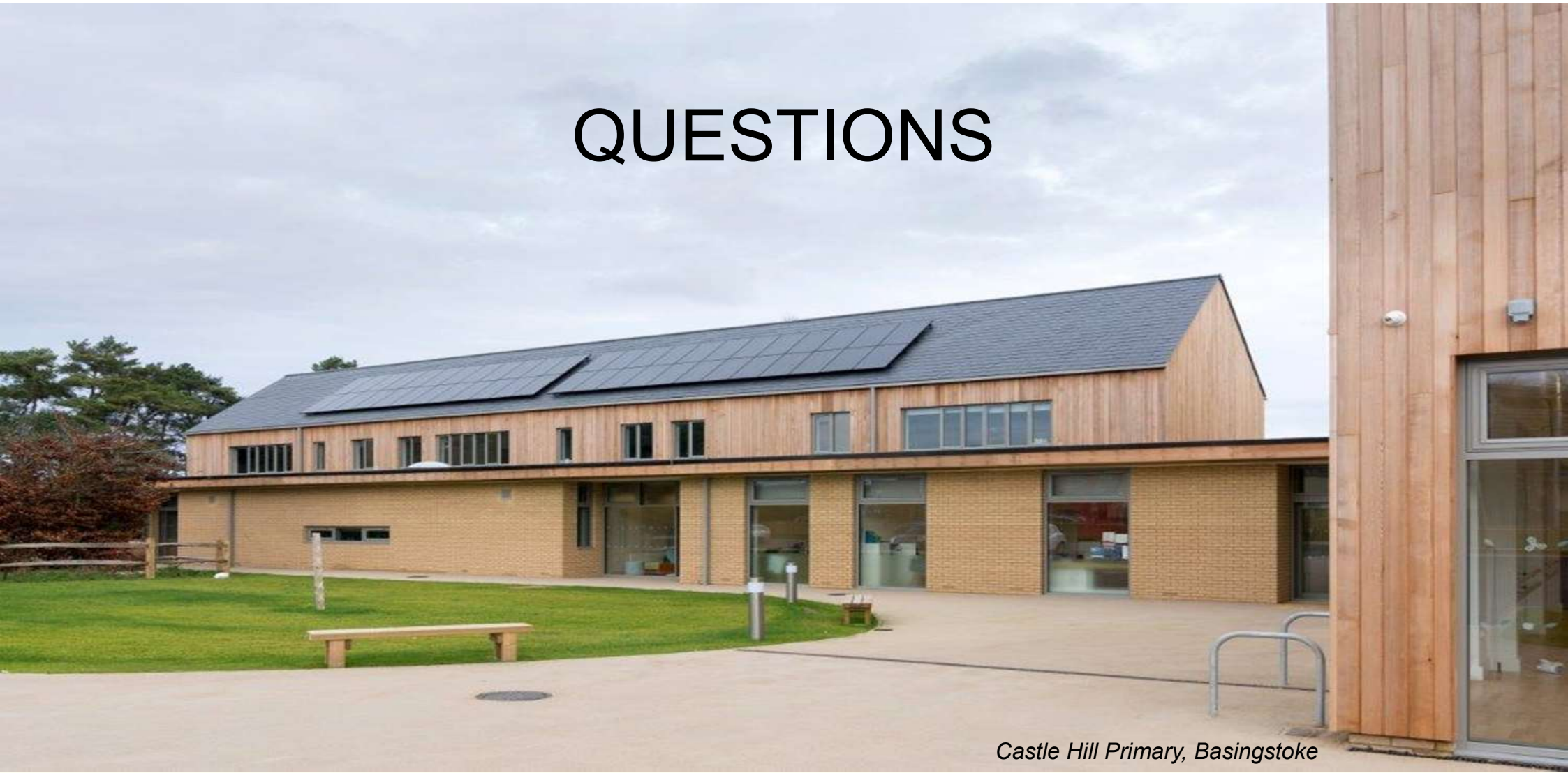
Castle Hill Primary, Basingstoke