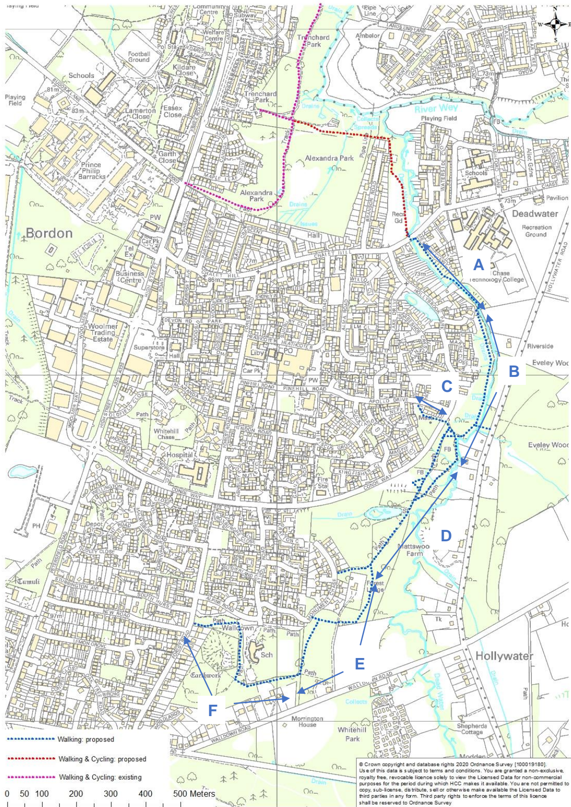
Figure 1 – Proposed South East Loop - Path