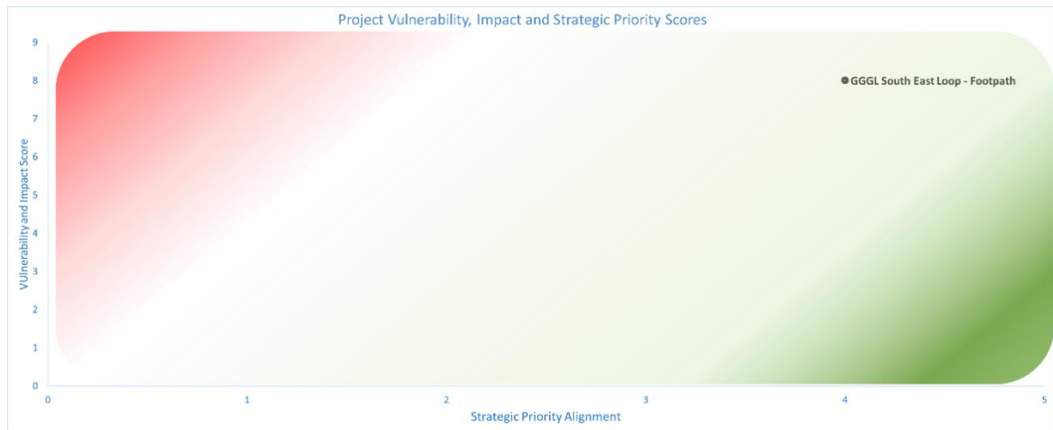
Vulnerability Impact and Strategic Priority Matrix