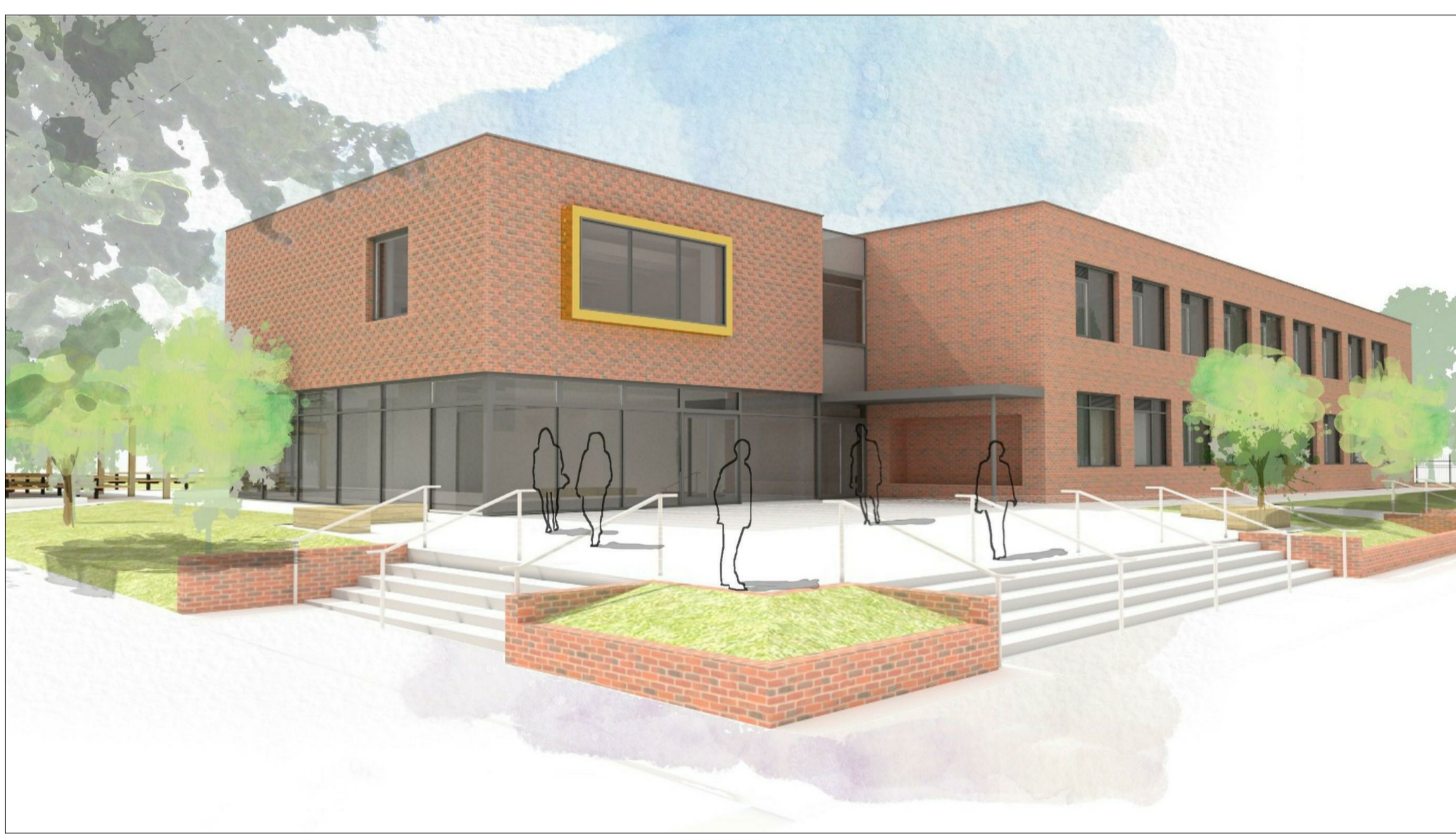
View of Proposed North Elevation