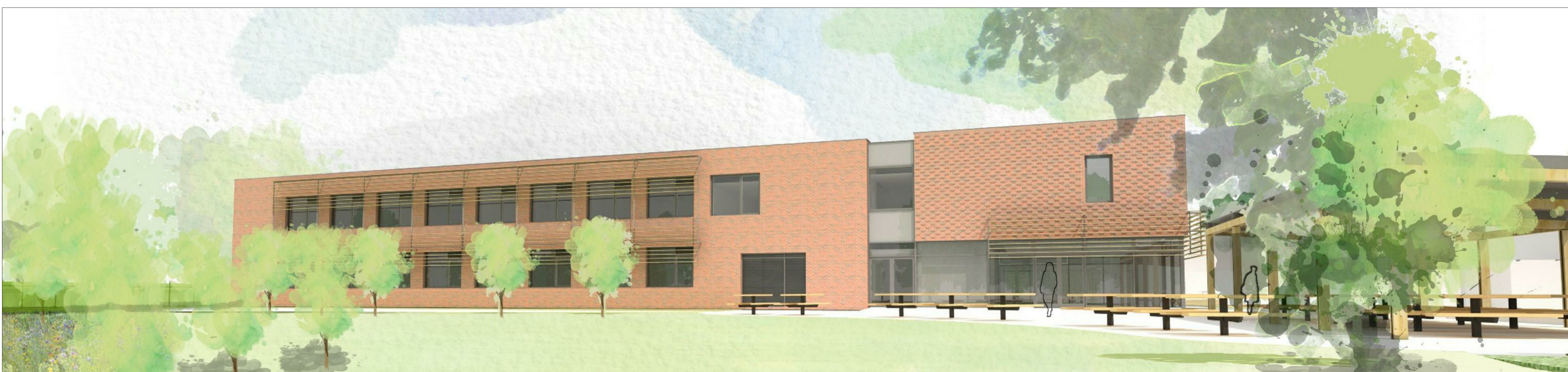
View of Proposed South Elevation - External Dining Area