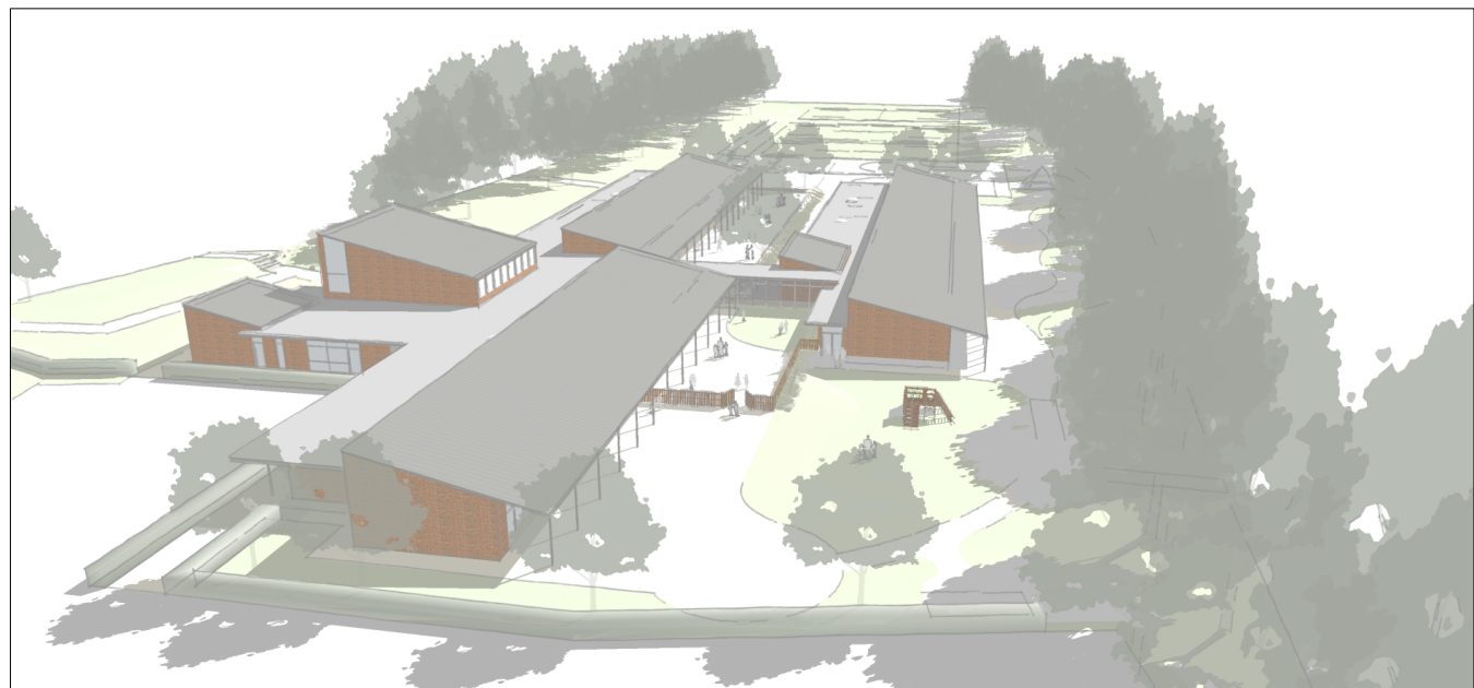
Proposed Aerial View Looking North East