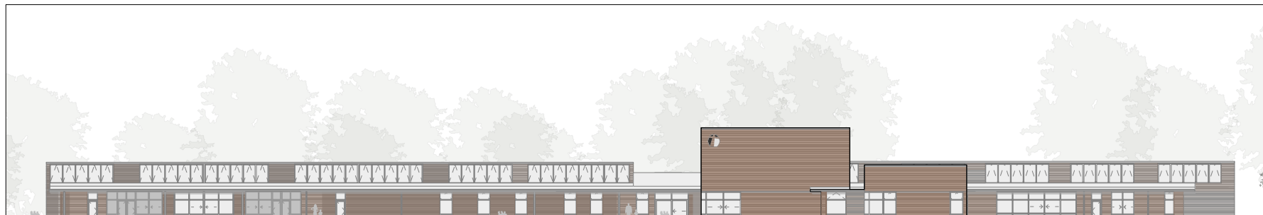
Proposed Front Elevation (North) 1:500@A3

© Crown Copyright and database rights 2016. All rights reserved. HCC 100019180.