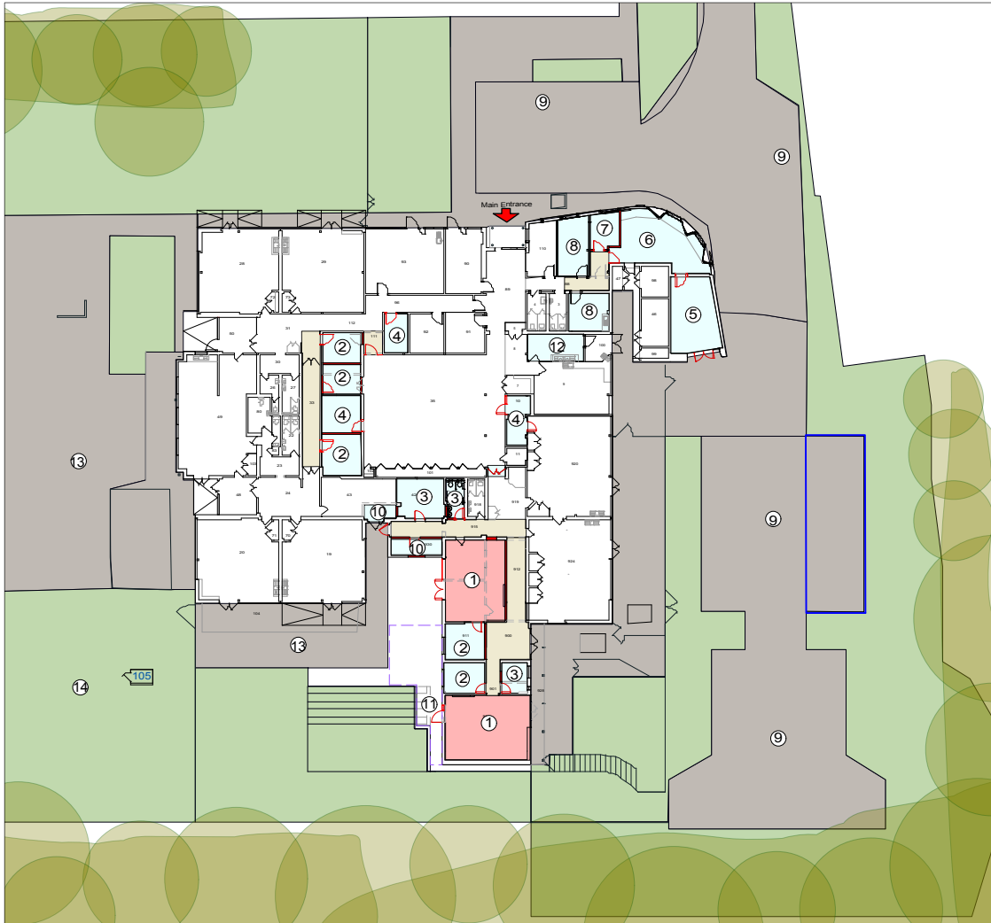
Proposed Site Ground Floor Plan