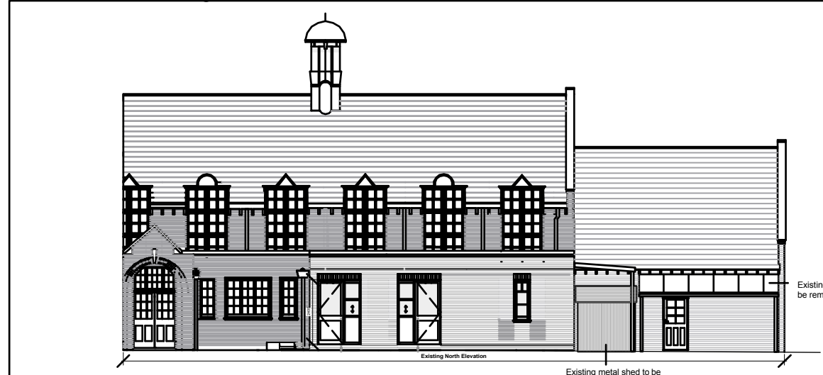
Existing North elevation A