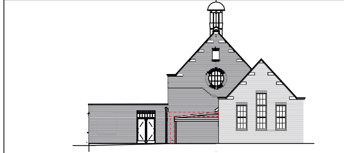
Existing West elevation B