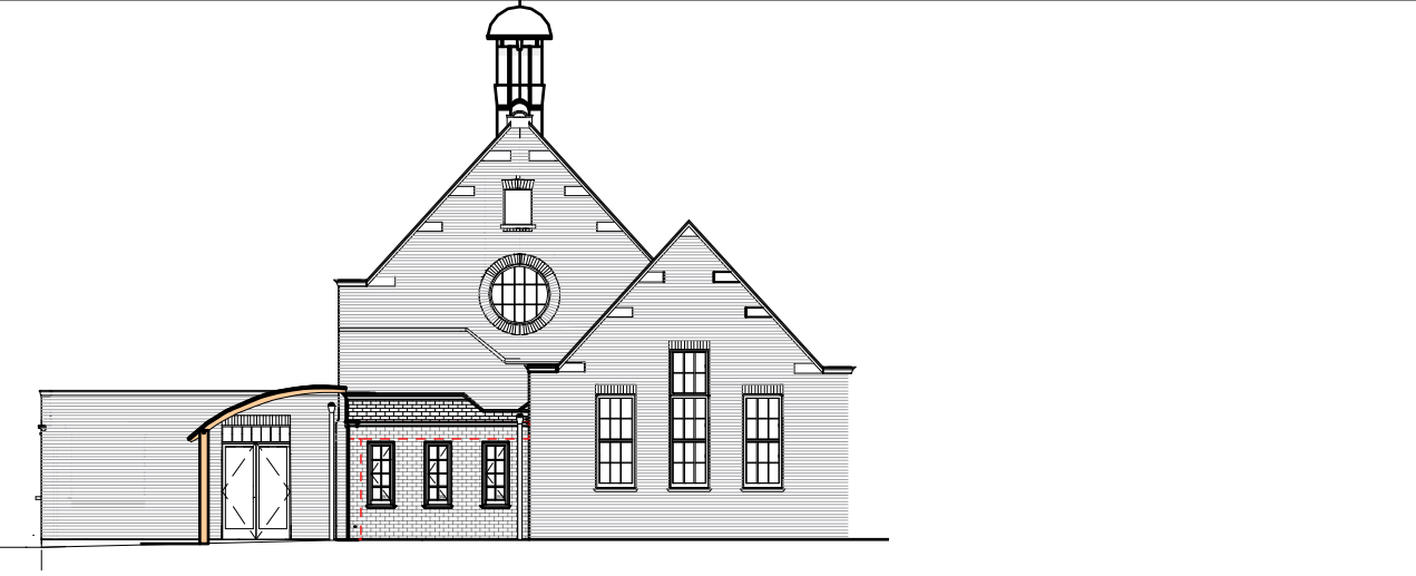
Proposed West elevation B