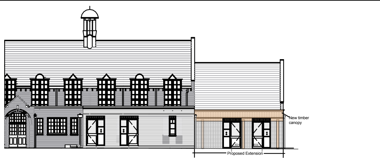
Proposed North elevation A