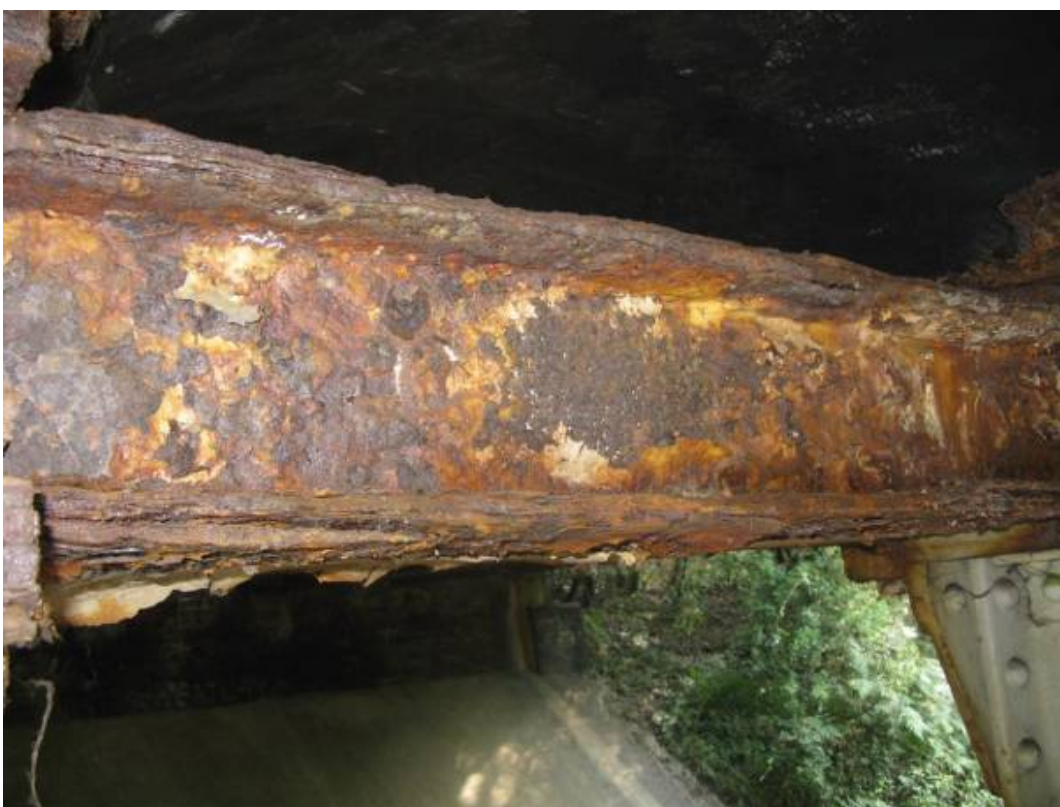
Typical advanced corrosion of members underneath the bridge.