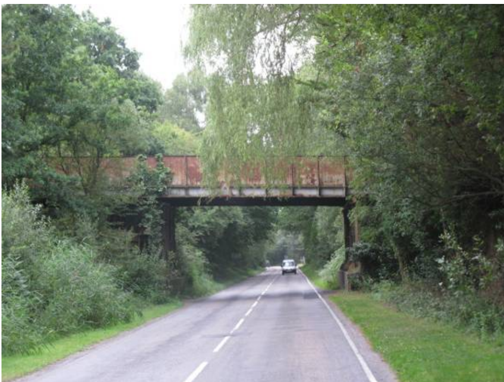
Elevation of existing three span steel bridge.