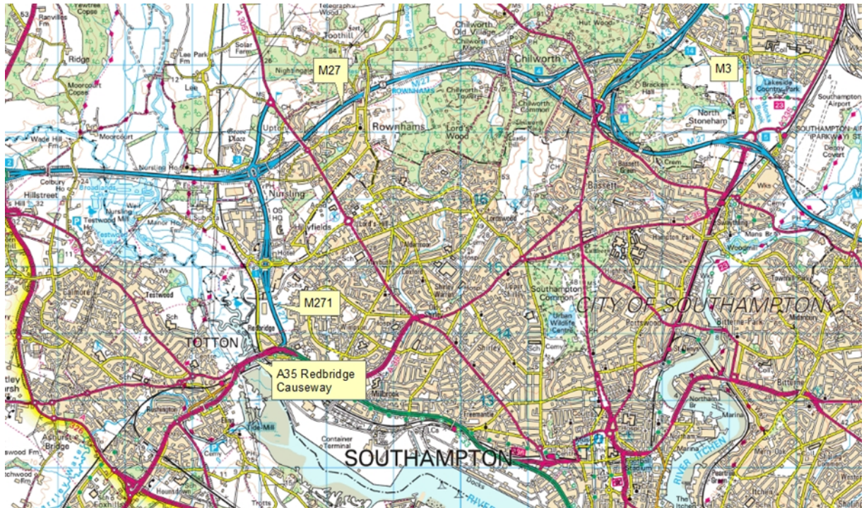
Location of Redbridge Causeway