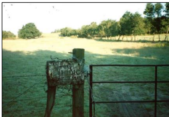
13.119. Photo 4 is of a sign adjacent to Route C; the sign is by a gate at the end of Route A. The Sign states “No public right of Way” . Landowner 1 has stated that the sign is situated “on gate leading from Route A onto Kingston Common dating from 1976 when gate was first made in fence by farm tenant” .