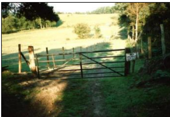
13.121. Photo 6 is of a sign adjacent to Route C, the sign is by a gate to the north of the end of Route A. The sign states " No public right of way ". Landowner 1 has written on the back of the photograph that this gate was " probably used by [a user of the route] as a child when there was no right of way from Route A to Kingston Great Common ".