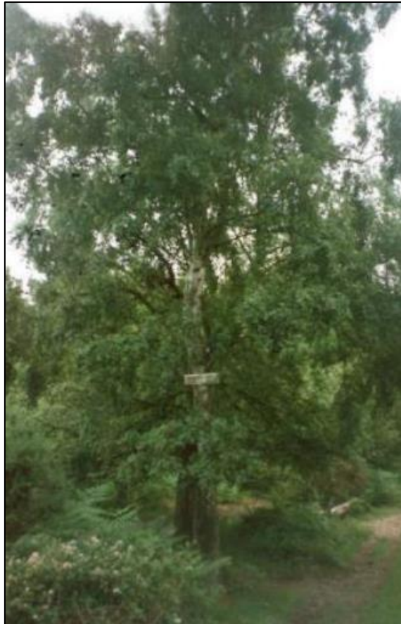
13.118. Photo 3 is of a sign on Route B, Landowner 1 has stated on the back of the photograph “Notice on track near my Sandford boundary” .